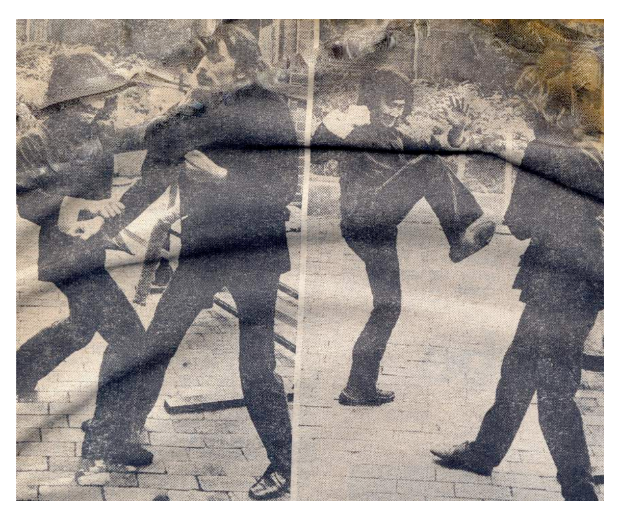
Lawrence appearing as part of a week long feature in the Daily Mirror (1974)

Lawrence appeared in many newspaper and magazine articles throughout the seventies and eighties and in the early days of growing public awareness of Chinese martial arts Lawrence was the public face of kung fu.